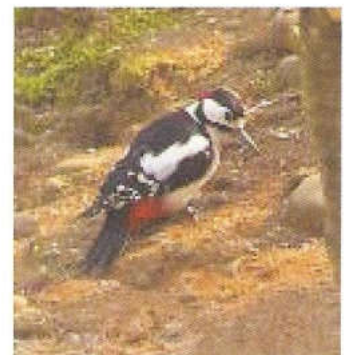
Greater spotted woodpecker

As the trees come into leaf it is becoming more difficult to see the birds but I think we are improving our song recognition skills as the months go by. Now I thought that I was pretty good at recognising birds but it just goes to show that even those of us who have been 'birding' for many a year, we sometimes make mistakes. High up in a tree we saw a somewhat bedraggled bird and I was convinced that it was a great spotted woodpecker. Suddenly it moved and turned into a magpie. How did it do that!!?