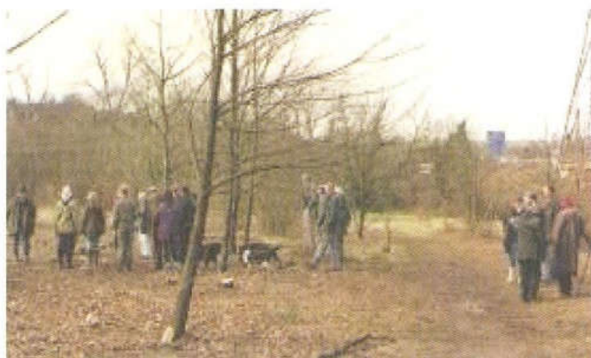
1992 The Reserve (Longwood Rd) How open it looks! note the M4 sign.