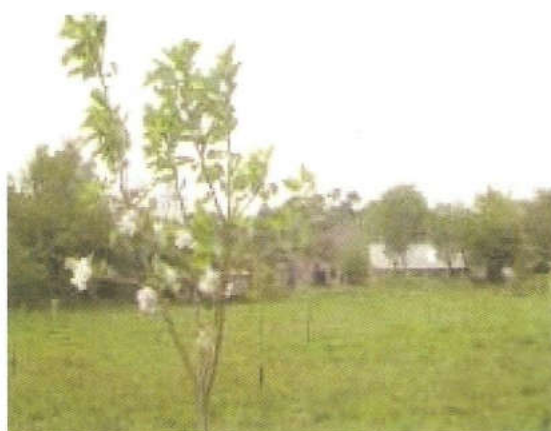
Blossom, May 2010, on one of the 52 trees now in the orchard