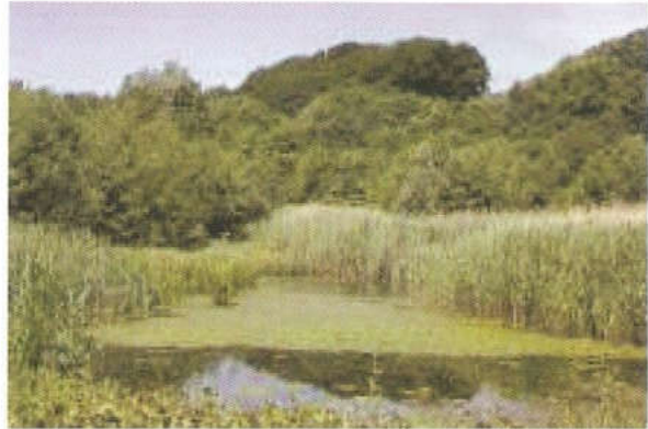
Result! View from the hide