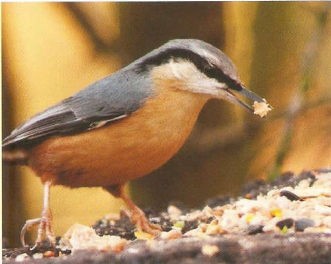
Nuthatch Photo taken by Steven Burnett *

The hedgerows and trees are coming into full leaf and the ponds are alive with young tadpoles, larvae and newts.