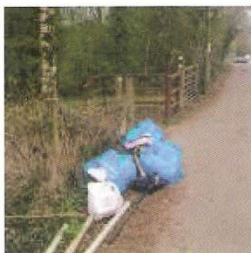
Just a few of the 50+ rubbish bags collected on the Litter Pick. April 2010 Longwood Drive

I am not sure it is because I spend more time walking the streets (I now have a dog) or because of the hard winter that killed the vegetation but there seems to be more litter around than in previous years.